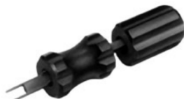
Extraction Tool Part No. 91019-3